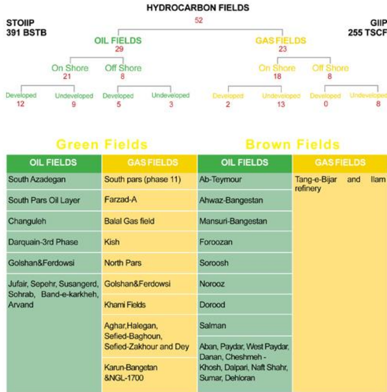
Figure 1: NIOC Projects

Every operational activity in Oil and Gas fields is performed in a special context which refers to the cultural, social, environmental, natural and geographical aspects of that site and when a company intends to do a feasibility study for each site, each site’s specific conditions and circumstances should be taken into account and consideration. As mentioned before, the IPC is concentrated on 52 hydrocarbon fields and 18 exploration blocks (Figure 1) and CBC will document the comprehensive and validated information about these fields including: Environmental regulations and laws, Climate, Local labor, Social considerations, Ethnic issues and etc.